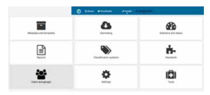
Figure 4. Back-office administration console

Data Infrastructure are implemented. SNIG GeoPortal has three major components: Access, Share and Learn More.