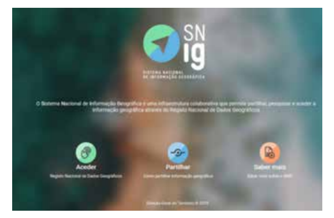
Figure 3. SNIG GeoPortal main page

It should be noted that in the new GeoPortal two metadata catalogs coexist: