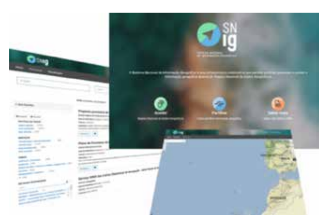
Figure 1. SNIG GeoPortal

In 1999 the SNIG portal was reformulated and a site based on HTML was launched, GEOCID, as the citizen gate do the NSDI. In 2006 the SNIG GeoPortal was launched, already containing a metadata catalog, an online metadata editor and a viewer, adjusted to